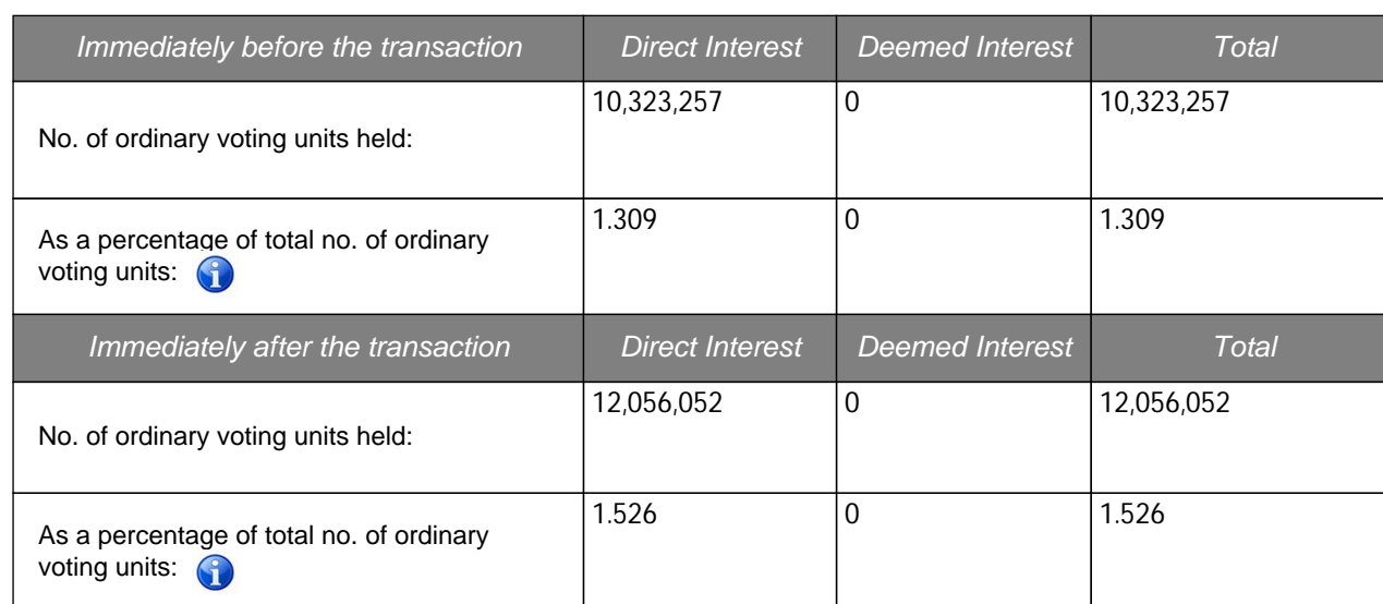
Table 1. Change in respect of ordinary voting units of Listed Issuer